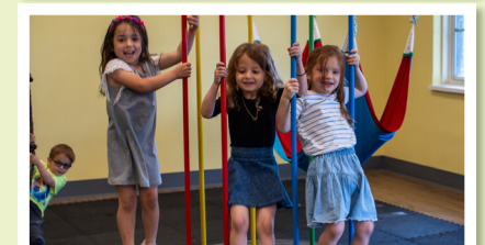
“Morah, look what I can do! And Morah, look at me!” are constant refrains as children swing from a trapeze or climb to the top of a tall ladder for the first time.